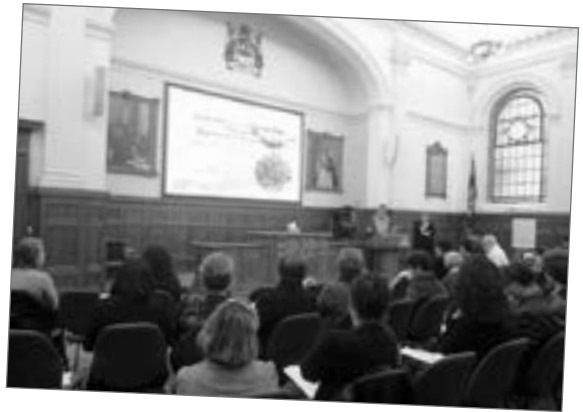
Launch of the InnerCity Network, 13 November 2014

In November 2014, ADCOSS launched the InnerCity Network (ICN). Another network, another support group. Why was this needed?