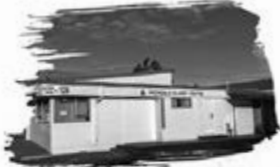
Kick off Ceremony and Tour of Auckland Islamic Centre 122 Brookhouse Bay Road, Avenisle (enter via Tait Street) Saturday 4th November 2:30pm - 4pm Refreshments following, no shoes to be worn at worship area.

KICK OFF OPENING CEREMONY Saturday 4th November at 2:30pm Auradate Islamic Centre, 122 Brookhouse Bay Road, Avenisle Visit any of the houses of worship below at the times listed.