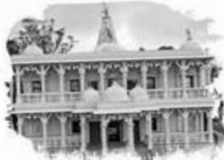
BAPS Shri Swaminarayan Mandir (Hindu Temple) 21 Barnhead Place, Avenisle Sunday 5th November 3pm - 4pm Refreshments following, no shoes to be worn at worship area.