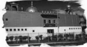
Gurudwara Nanakhar (Sikh Temple) 100-106 Great South Road, Manurewa Wednesday 8th November 7pm - 8:30pm Remove shoes at entrance. Head coverings will be provided (or bring your own). Wear loose clothing for sitting on the carpeted floor. Refreshments following.