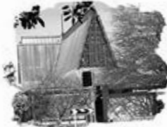
St Joseph's Catholic Church 10 Dominion Street, Takapuna Tuesday 7th November 7pm - 8pm Refreshments following.