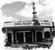
Al-Mustafa Jamia Masjid (Muslim) 26 Alangone Road, Mangere Sunday 12th November 2:30pm - 3:30pm Refreshments following.

Initiative of the Auckland Inter-Faith Council www.aucklandinterfaithcouncil.org.nz or contact raabk@gmail.com