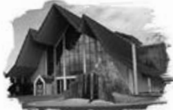
Holy Trinity Cathedral (Anglican) Cnr St Stephens Avenue & Parnell Road, Parnell Friday 10th November 7pm - 8pm Refreshments following.