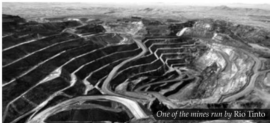
One of the mines run by Rio Tinto

staring everyone in the face because it is hitting them. By then it's too late.